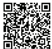
2022 Community Needs Assessment

Racial and social injustice are significant root causes of poverty. The differences in responses based on race and ethnicity highlight systemic inequity as a major factor affecting community needs. For example, the most common health-related issue over the past 12 months for individuals identifying as White or Caucasian is “experienced a mental health issue.” For all other races and ethnicities, the most common health-related issue is “not enough groceries to meet needs.”